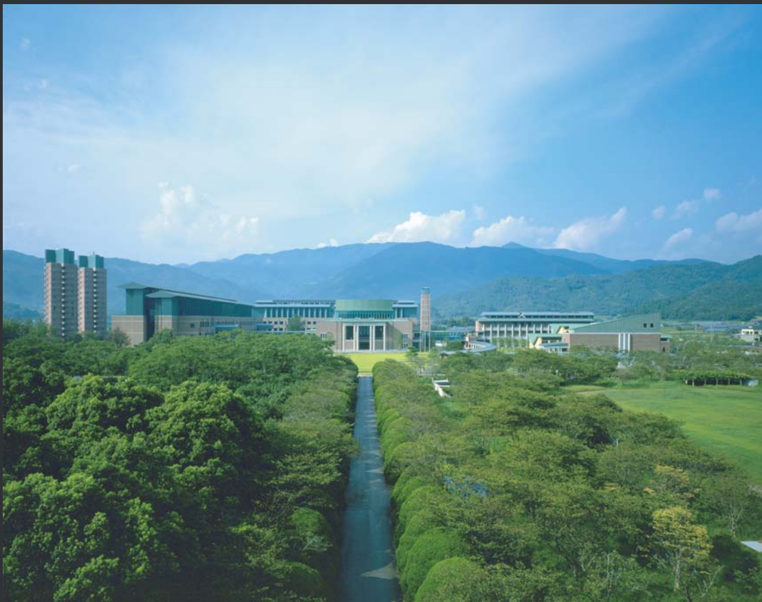
Kochi Institute of Technology, Kochi, Japan