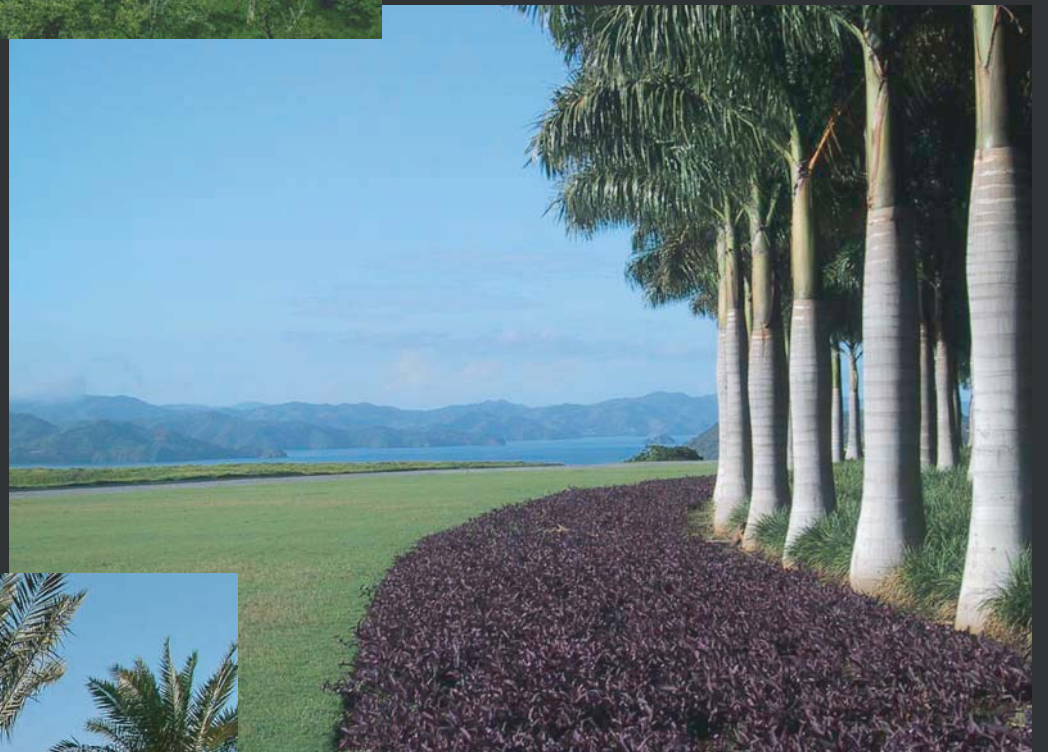
Peninsula Papagayo Resort, Guanacaste, Costa Rica