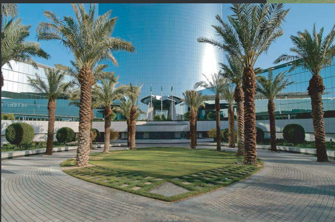
Kingdom Centre, Riyadh, Saudi Arabia