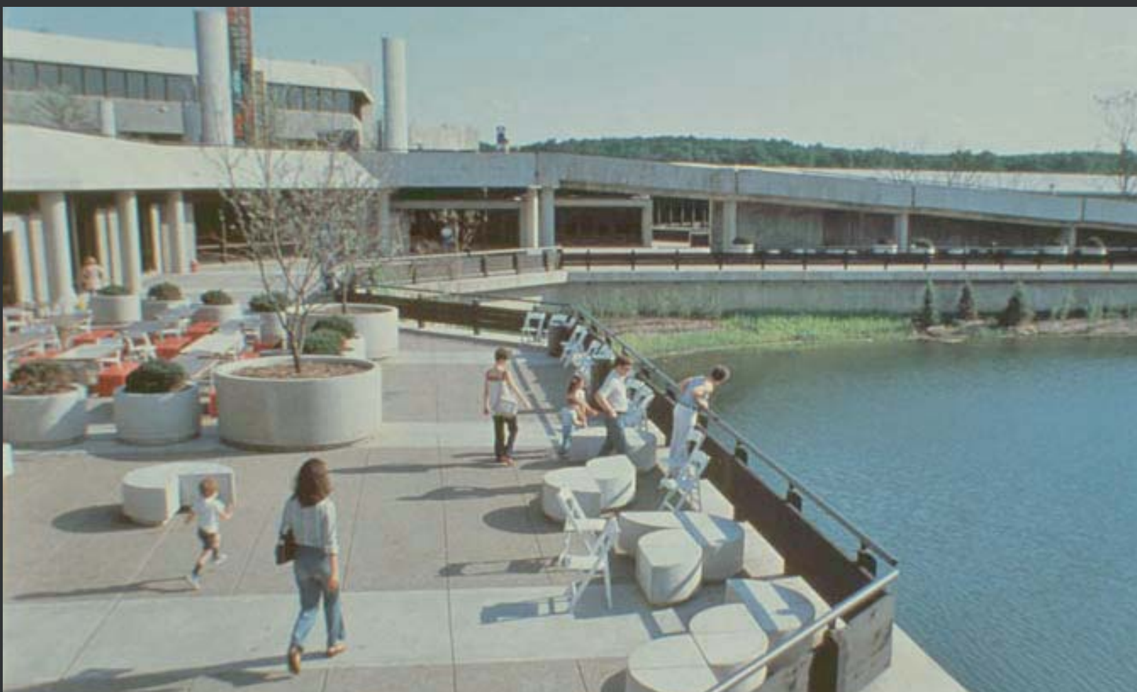
Minnesota Zoo - Apple Valley, MN