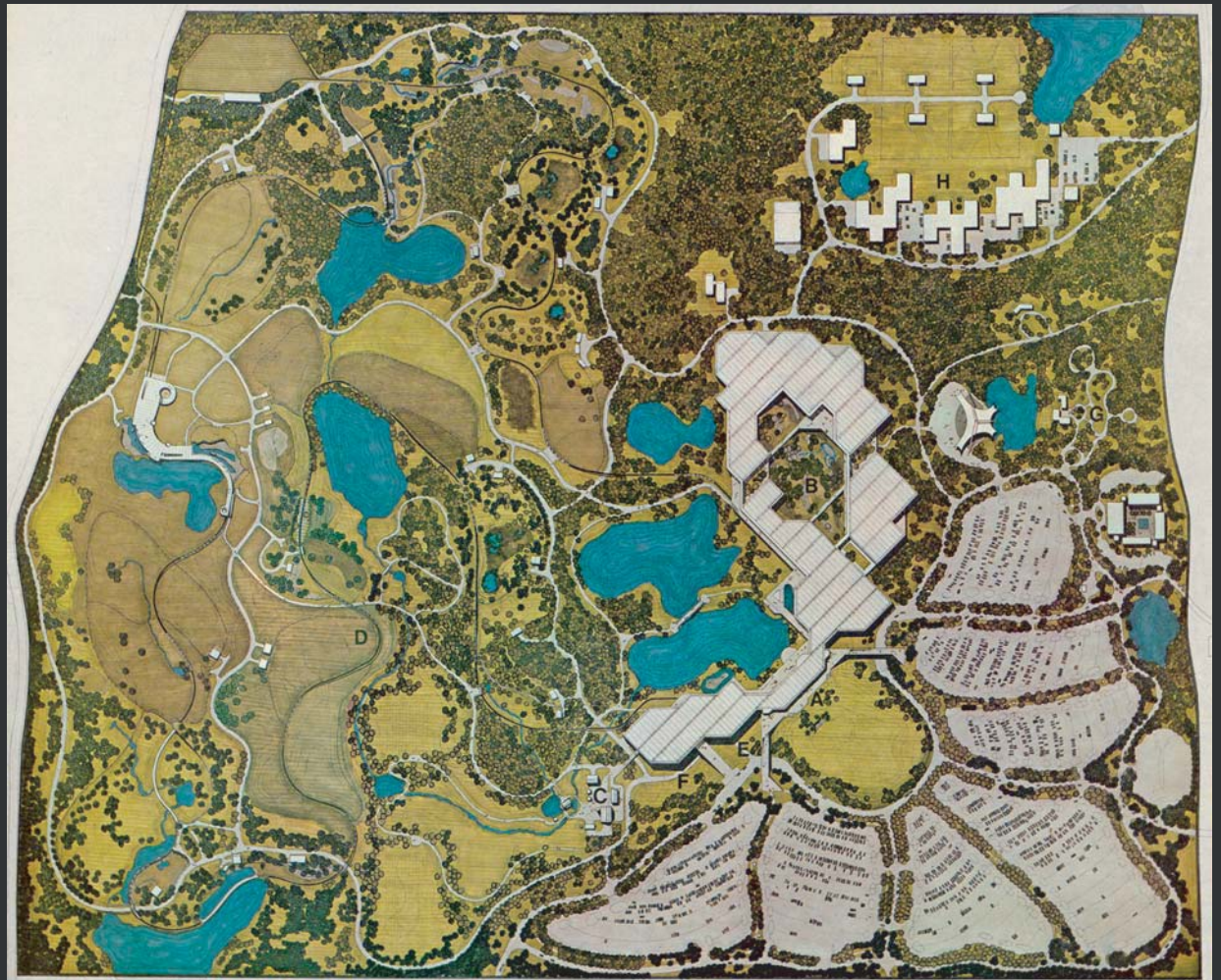
Minnesota Zoo Master Plan, 1971 - Apple Valley, MN