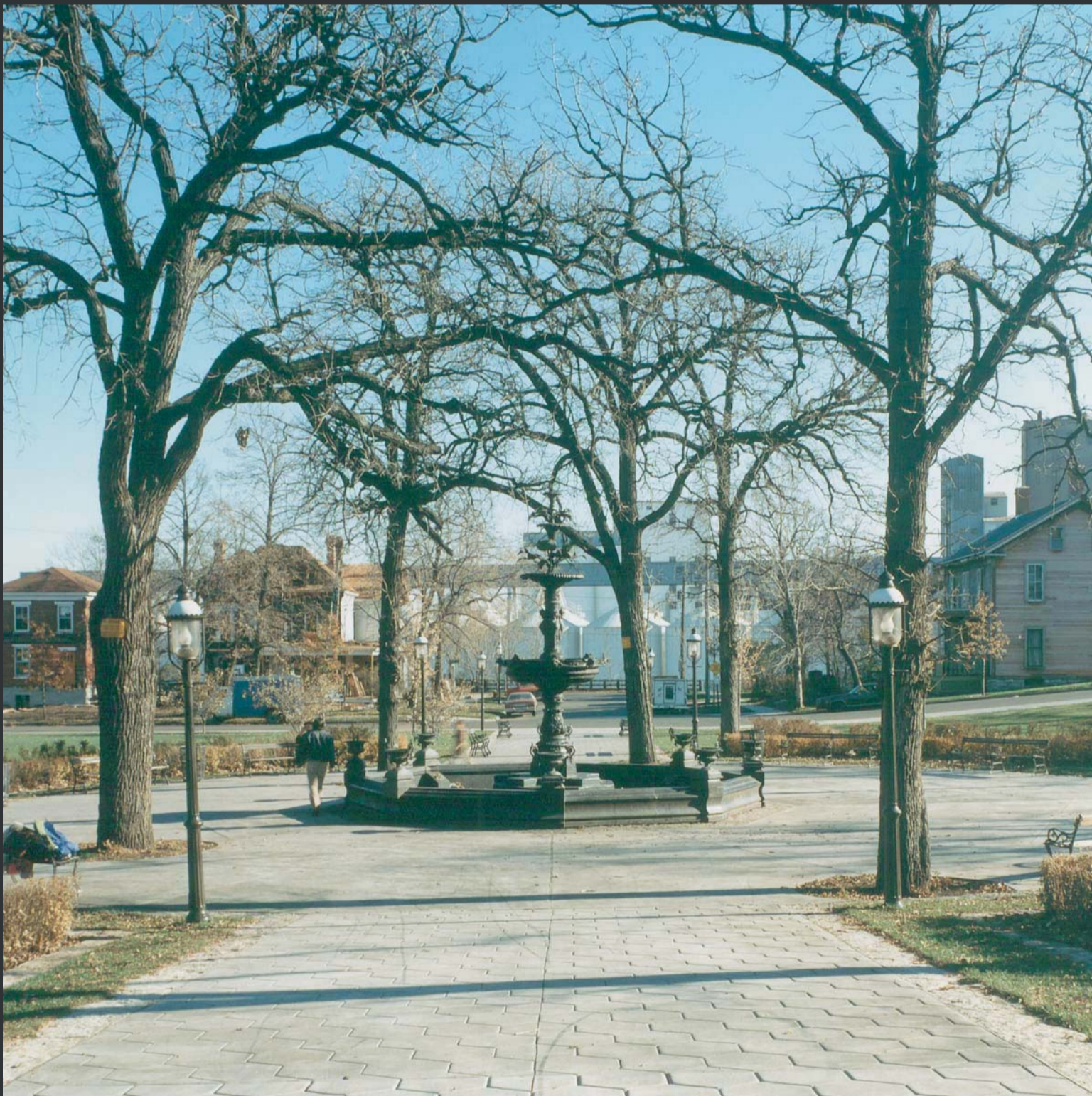
Irvine Park Fountain - St. Paul, MN