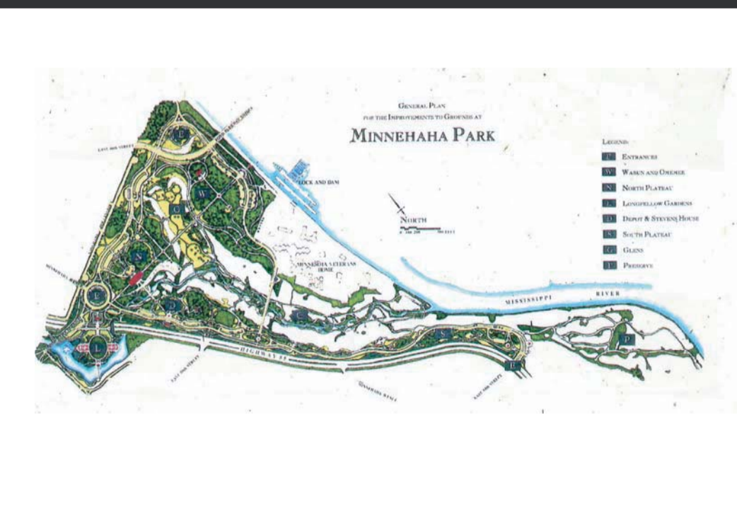
Minnehaha Park Master Plan - Minneapolis, MN