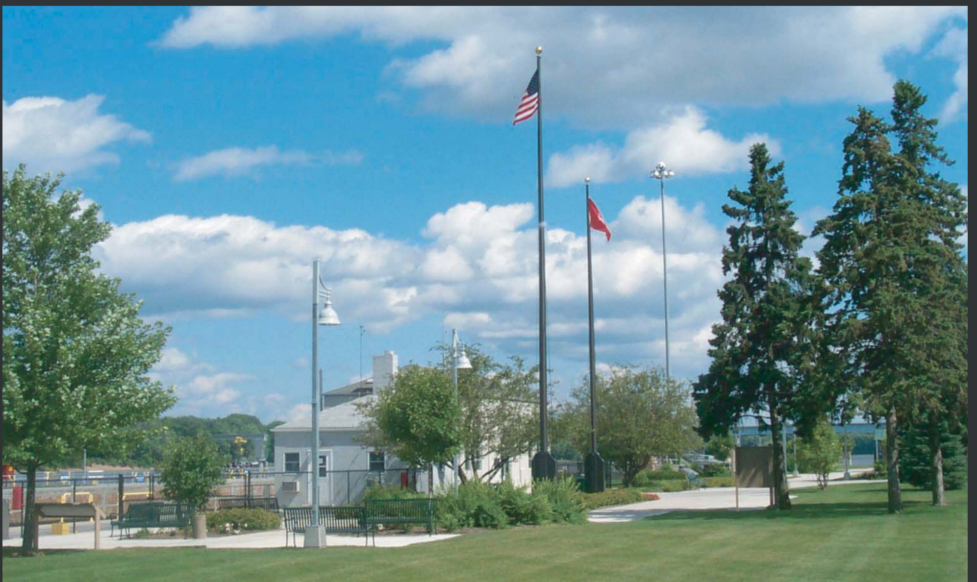
Mississippi River Lock and Dam 7 and Museum