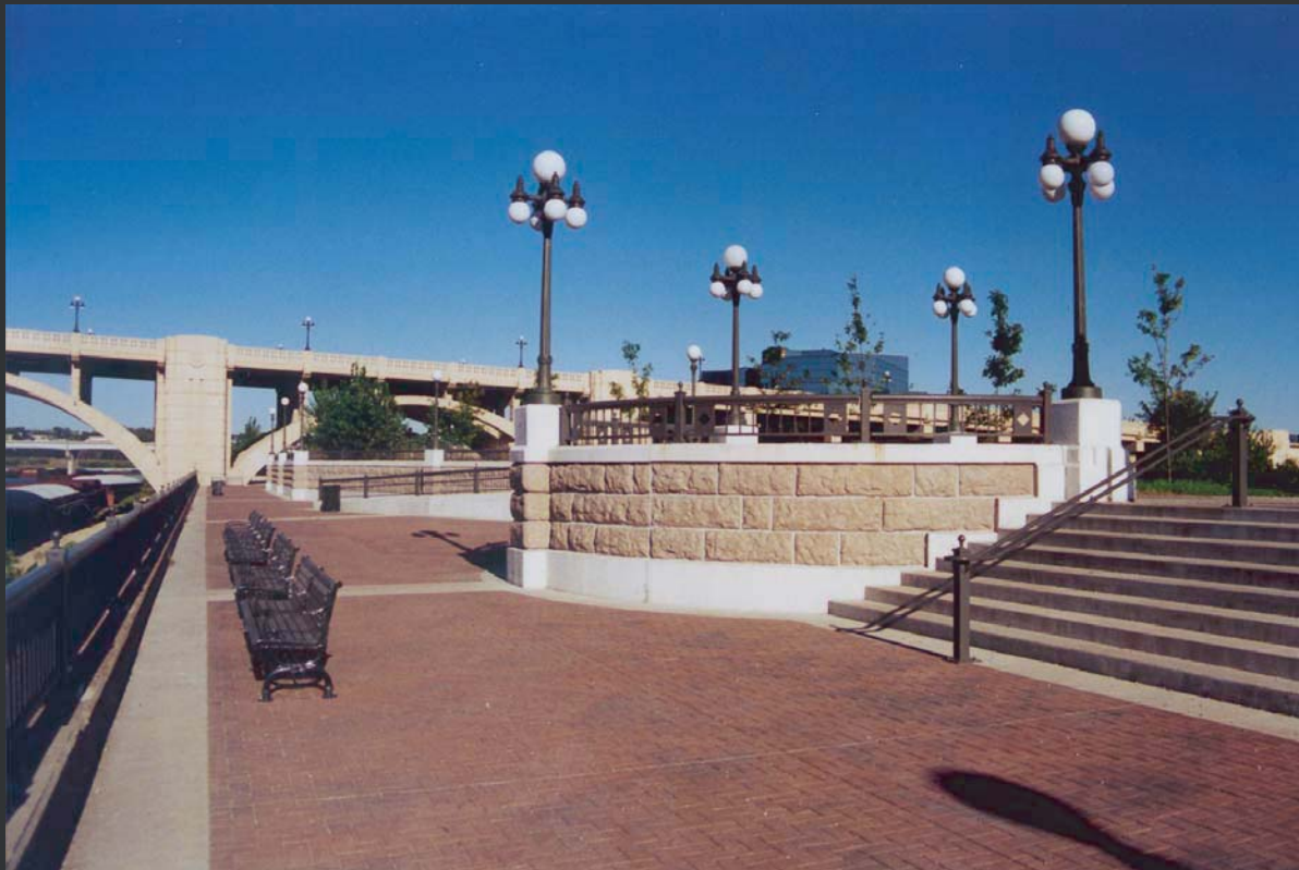
St. Paul Riverfront Flood Control